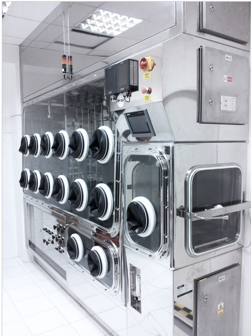
Isolator workplace for research into HPP synthesis and isolation of semi-finished products or their purification | Teva Czech Industries s.r.o.