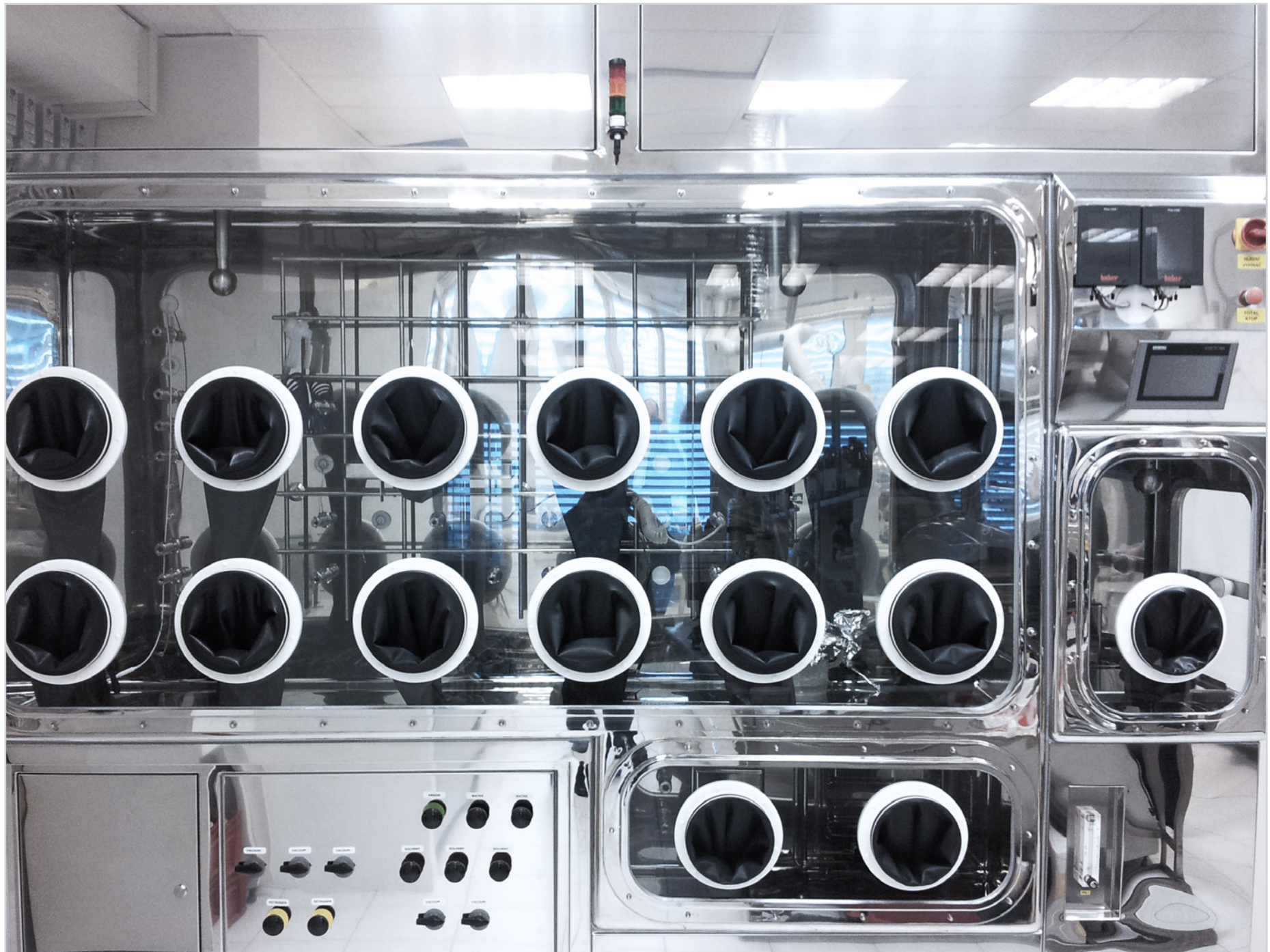
Isolator workplace for research into HPP synthesis and isolation of semi-finished products or their purification | Teva Czech Industries s.r.o.