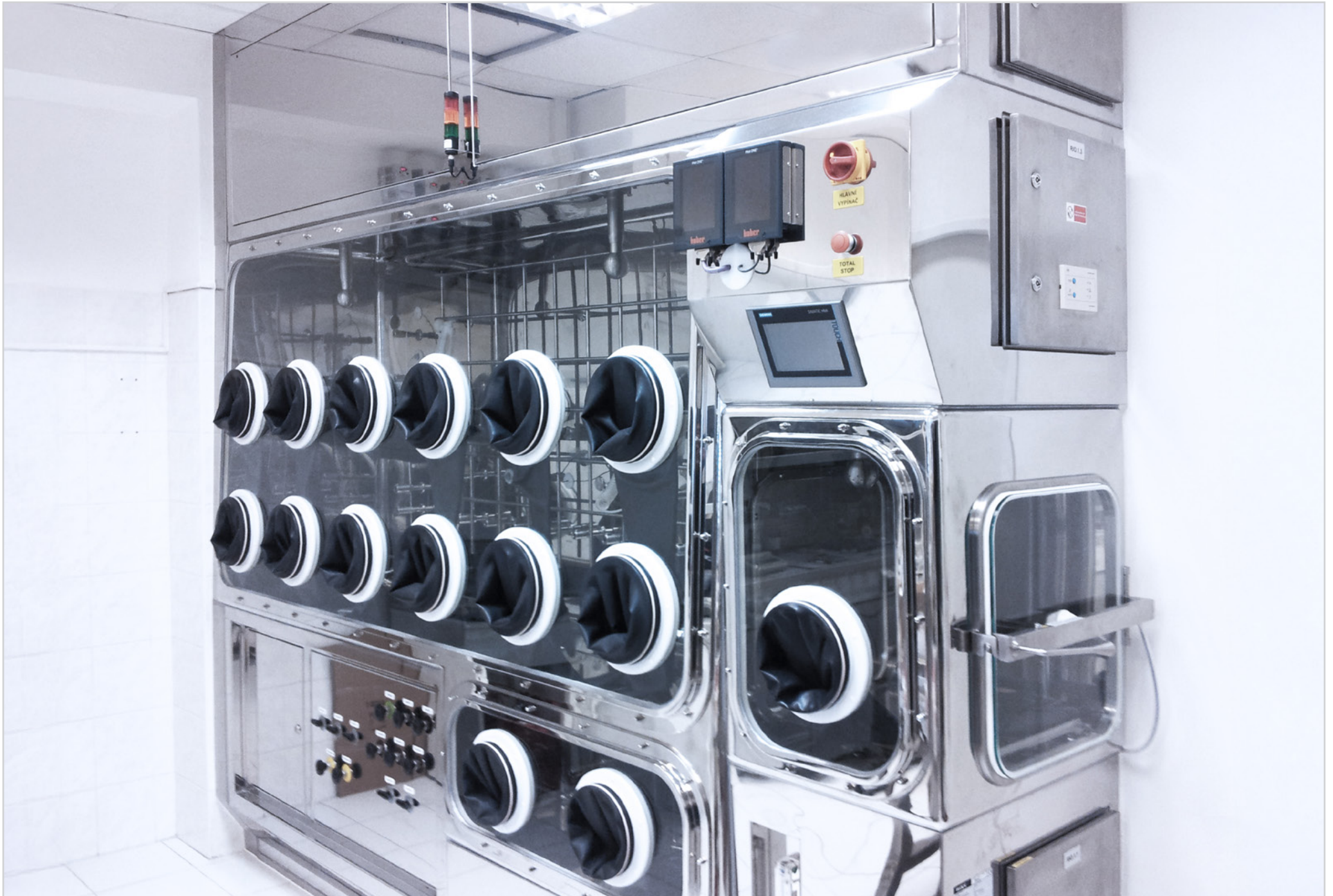
Isolator workplace for research into HPP synthesis and isolation of semi-finished products or their purification | Teva Czech Industries s.r.o.